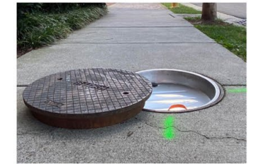
It's a change that likely won't go noticed by many Alexandrians, but the city is making an adjustment to its manholes that could have an impact on flooding during storms.