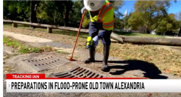
Alexandria provides up to $5,000 in flood mitigation program

Reporters have done 12 stories on different parts of the Flood Action Alexandria program since August. Stories touch on project acceleration, grants used in flood mitigation work and the manhole insert project. News outlets include: ALX Now, AlexTimes, WUSA 9, WJLA, Fox 5, NBC 4, DC News Now and WAMU 88.5. Staff will continue working with reporters to share information and updates.