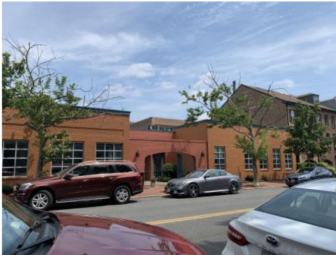
Former location of the Hallowell School on North Alfred Street.

A year later, the Alexandria Gazette took the school board to task for their inaction, writing in an editorial, “the housing of colored pupils is another difficult problem. Since the destruction by fire of the Snowden building several years ago the board has been renting buildings for colored boys. Hallowell School Building for colored girls in the northern section of the city has long outlived its day of usefulness and has passed beyond the stage of repair.” [Endnote 18, Deeper Dig 10 ]