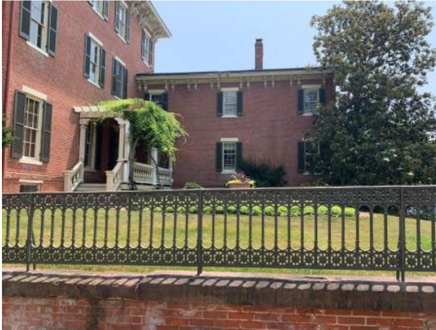
The old female free school adjoined the Orphan Asylum on the corner of Wolfe and St. Asaph Streets.

The white boys assigned to Custis School learned in two different locations - "the second floor of Harlow's new building on the Northwest corner of Royal and Cameron Streets" and in a house next to the Northeast corner of King and Columbus streets, according to the Alexandria Gazette , Dec. 31, 1870.