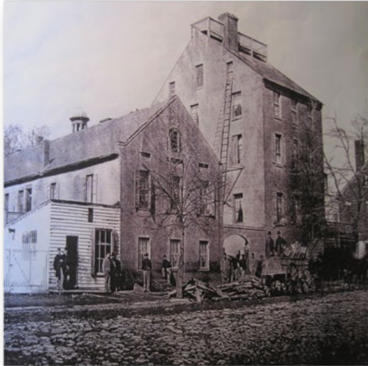
Hollowell School, when used as a hospital during the Civil War.

"Some Alexandrians have heretofore as a rule considered the schools of Alexandria as inferior to those in Washington and other cities. They have even gone so far as to send their children to other schools. At this time there is no need of it. Alexandria can offer the same educational facilities as any other city. An attempt has been made to induce these parents to send their children to the local high school this year..."