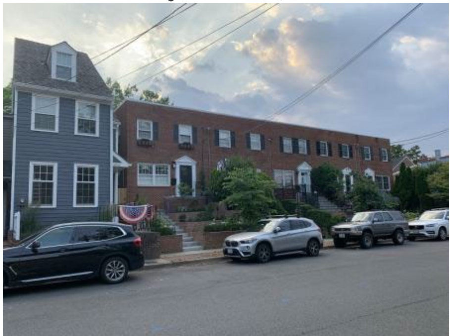
Former location of the Seaton School on South Pitt Street.