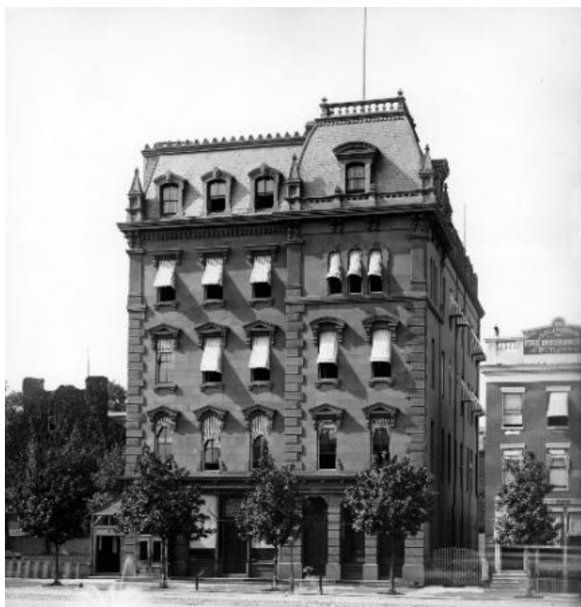
Figure 1 Freedman's Savings Bank in Washington, D.C., 1890.