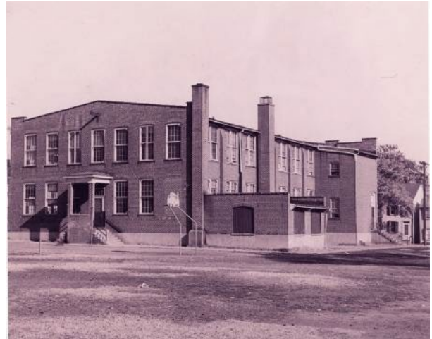
Lyles-Crouch Elementary School, in the old silk factory.

Secondary students at Parker-Gray still did not have high school facilities.