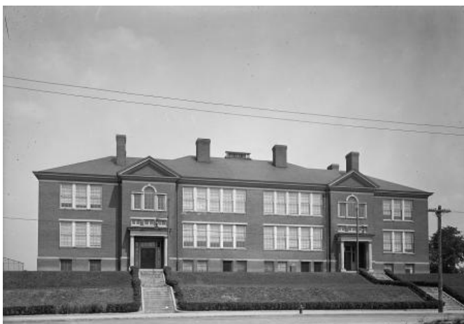
Figure 2 The old Alexandria High School, ca. 1917.

The newspaper's closing argument claimed Alexandria's schools were "second to none other in the state. Furnished with the best appliances, and conducted by a corps of competent teachers, they are attended by all classes of future citizens." Notably, the Gazette was writing exclusively to white Alexandrians, without any reference to the state of education for Black residents. [Endnote 13]