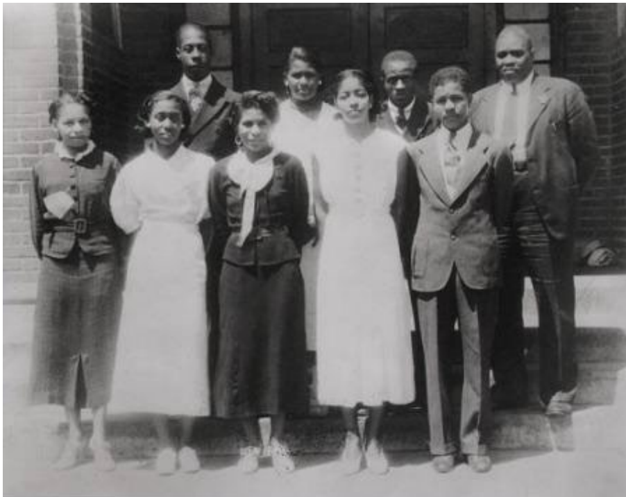
Parker-Gray Graduating Class of 1936

When Parker-Gray opened, Alexandria had two white public high schools: Alexandria High School and George Mason High School on Cameron Mills Road. There were still no proper public secondary options in the city for Black families. In 1932, Parker-Gray teachers decided to put together a high school class that graduated in 1936. Alexandria's African Americans continued to advocate for a secondary school and another primary school.