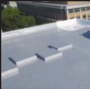
^ SINGLE PLY MEMBRANE 20TH - 21ST CENTURY