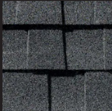
^ ARCHITECTURAL GRADE ASPHALT 20TH - 21ST CENTURY