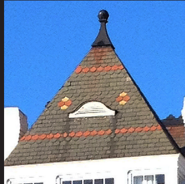
^ POLYCHROME SLATE MID 19TH - EARLY 20TH CENTURY