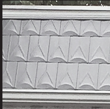
^ STAMPED METAL SHINGLE 19TH - 21ST CENTURY