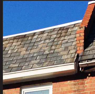
^ SLATE SHINGLE 19TH - 21ST CENTURY