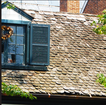
^ FISHSCALE WOOD SHINGLE 18TH - 19TH CENTURY