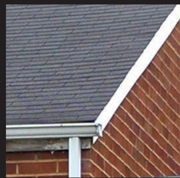
^ 3-TAB COMPOSITION 20TH - 21ST CENTURY