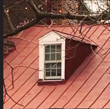
^ STANDING SEAM METAL MID 19TH - 21ST CENTURY