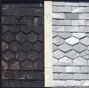
^ FANCY CUT SLATE 19TH - EARLY 20TH CENTURY