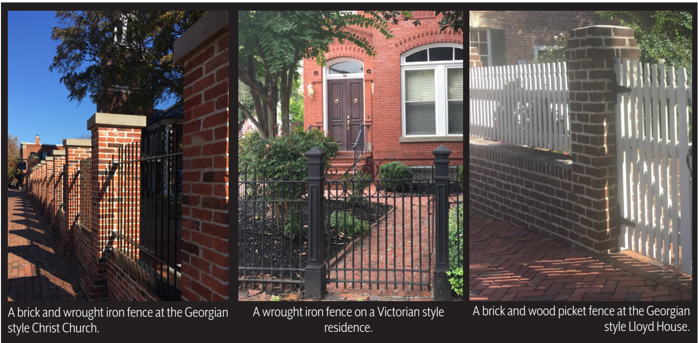
A brick and wrought iron fence at the Georgian style Christ Church.